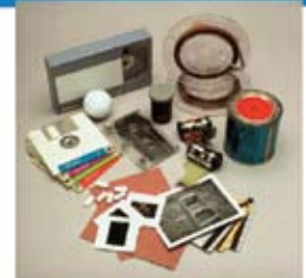
Adhesives Paintings & Coatings