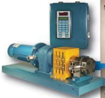
Zenith Metering Systems