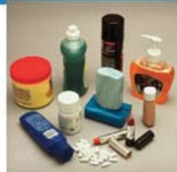
Food Personal Care